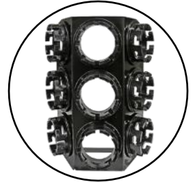
Die Rack 9 Station Die Holders (Included) P/N:102616-84mm