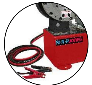
Available in 12VDC/24VDC