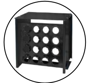
Available: Crimper Stand 16 Station Die Holders P/N:101247-84